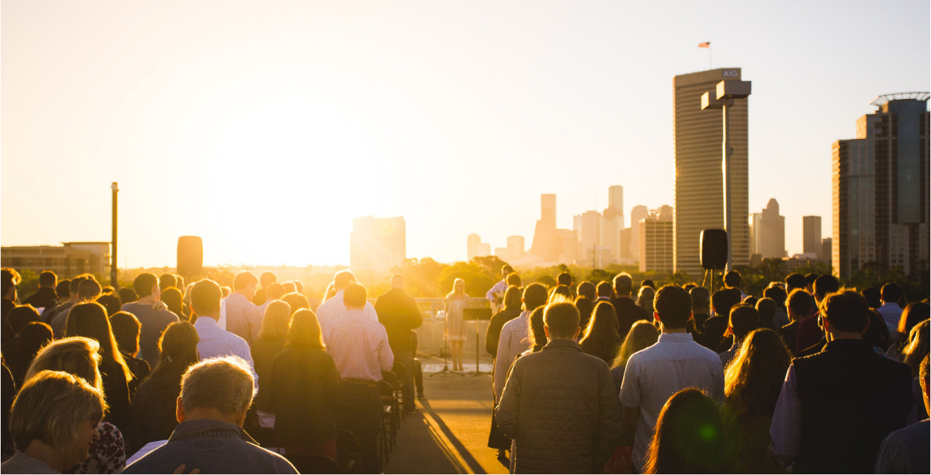
PHOTO DESCRIPTIONS Top: Worshipping at Sunrise Easter Service Right: Sending SMRCC on Multiplication Sunday Bottom: Commissioning future house church leaders